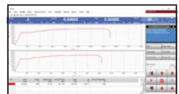
Test Curve Page

It can record the max. test force, fracture value, yield value, max. compression value automatically. It can also calculate the fracture extension & all kind of strength value manually. The RA232 connector can do the function of communicating with computer to do the data work. It is an essential equipment for manufacture, construction unit, product quality supervision & inspection bureau & building material test department. It also could be used in the university for teaching purpose.