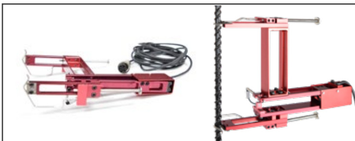
Axial Electronic Extensometer