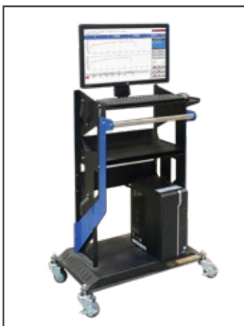
Desktop Computer Unit