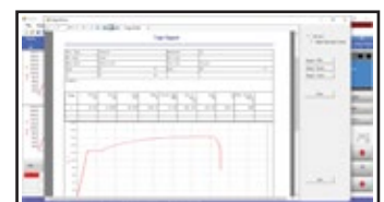
Test Result Page