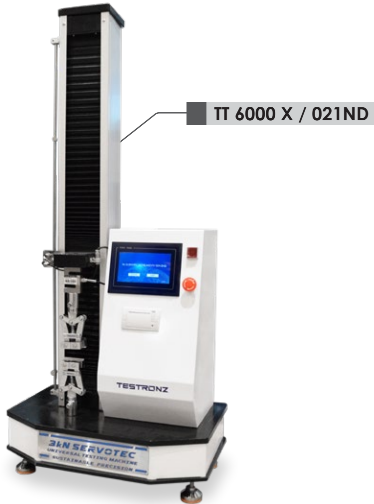
TT 6000 X / 021ND