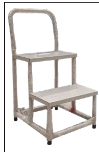
2 Steps Ladder