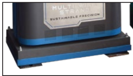
Shock Absorbing System