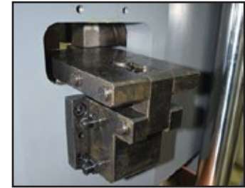
External Auto Grip