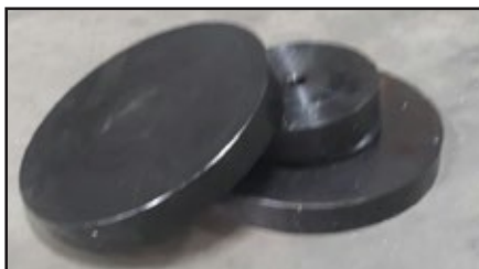
Compression Plated Set