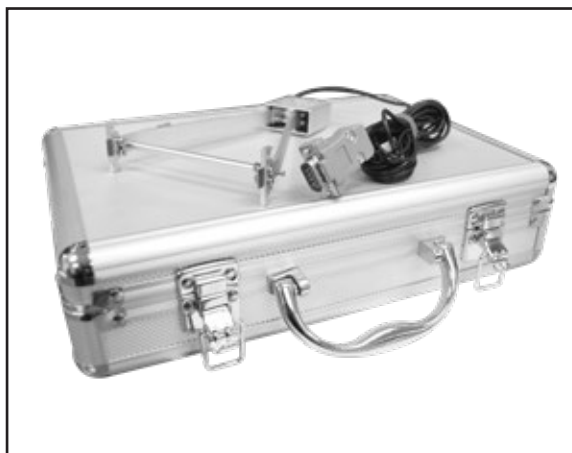
TT YYU - 25/100