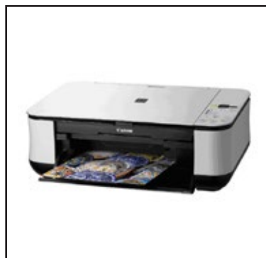
TT CP - 200