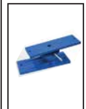
NL 5006 X / 003 - A004