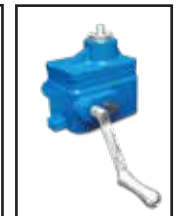
NL 5006 X / 003 - A003