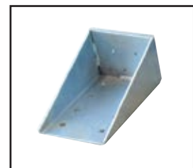
NL 5006 X / 003 – P 003