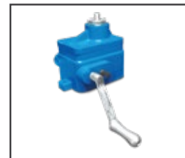
NL 5006 X / 003 – A003