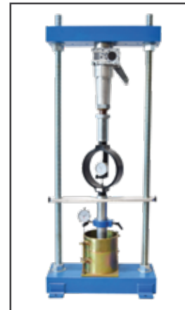
Lab test Set Up