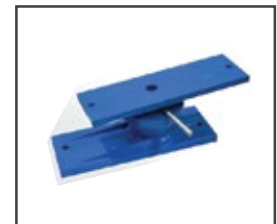
NL 5006 X / 003 – A004