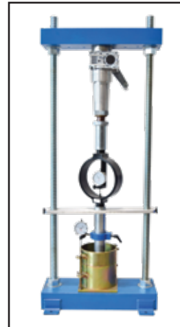
Lab test Set Up