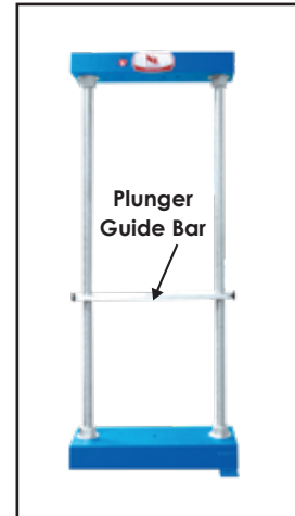
NL 5006 X / 003 – A001