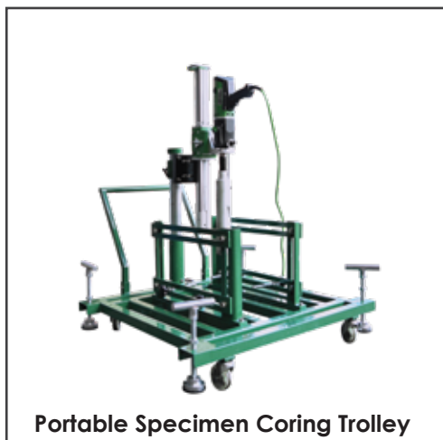
Portable Specimen Coring Trolley

RED LIGHT ON - Overload YELLOW LIGHT ON - Overheat RED & YELLOW LIGHT ON - Replacement Carbon Brush