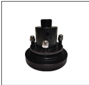
NL 3033 X 002 - P 002