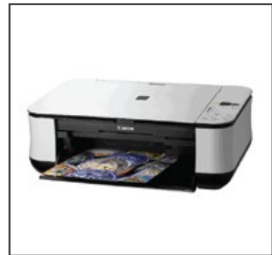
NL CP - 200