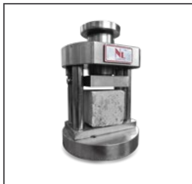
NL 3027 X 002 - P 002