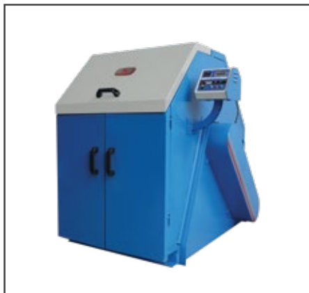
Closed Sound Proof Cabinet