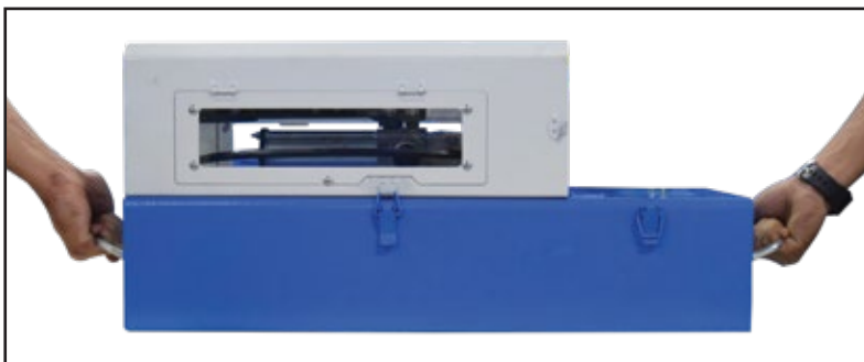
Handle for easy Portability