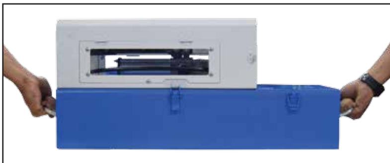
Handle for easy Portability