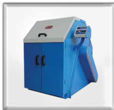
Closed Sound Proof Cabinet