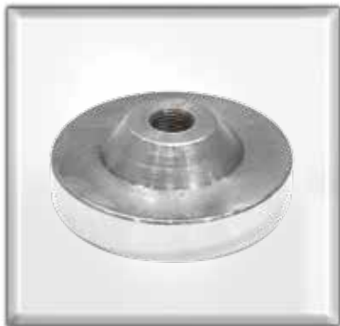
NL 3033 X 003 - P002