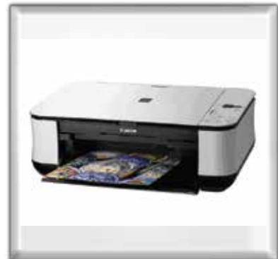
NL CP - 200