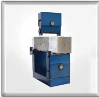
NL 3027 X 002 - P003