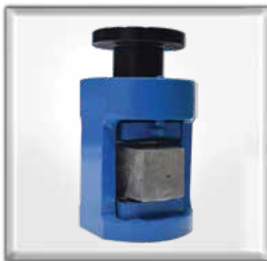
NL 3033 X 003 - P001