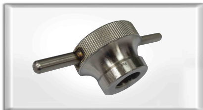
Quick Release Knob