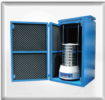
Noise Reduction Cabinet